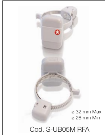
Cod. S-UB05M RFA