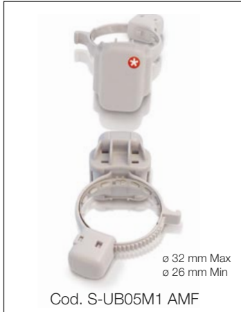
Cod. S-UB05M1 AMF